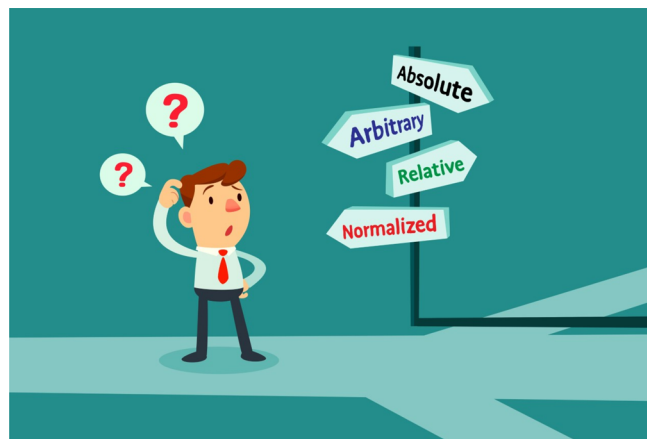
Figure 1. Which way do I go? Defining the y -axis scale of an x – y plot remains a key aspect.

A key aspect of expressing the y -axis of an x – y plot is the definition of the scale, which includes a proper axis title and associated units (Figure 1). When the measurement is absolute,